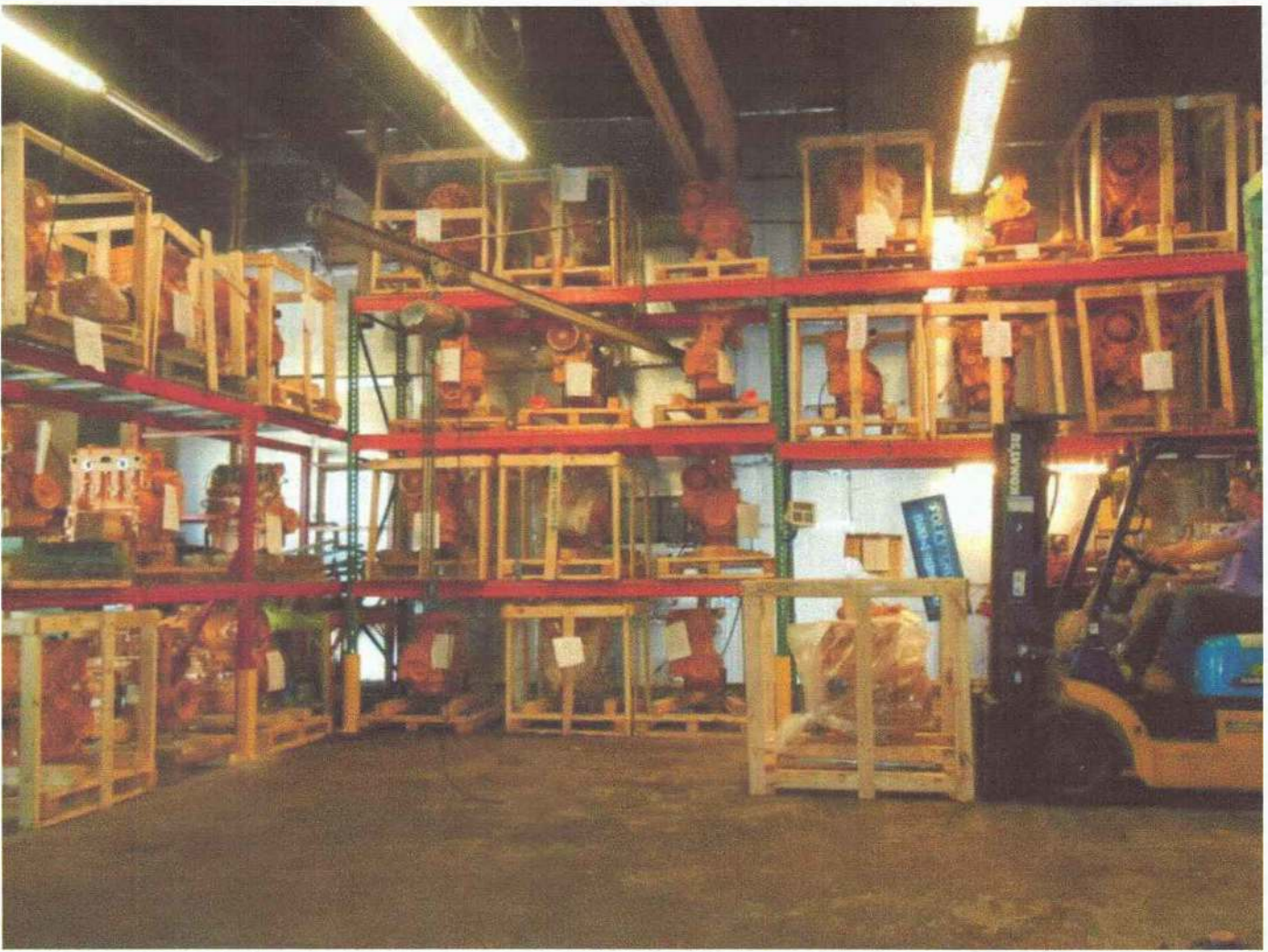
Deutz engines fill Foley Engines' warehouse in Worcester, Mass.

Foley Engines offers same day shipping on in stock parts. This gets orders processed and to customers as quickly as needed.