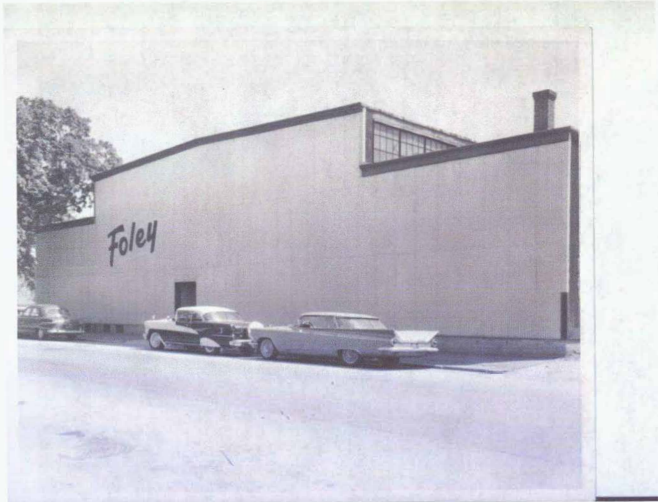
Foley Engines building, in the beginning. The company still operates out of this facility in Worcester.